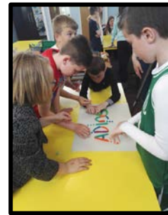
St Anthony's Primary children.

The team have been working on an exciting new animation project at Elderbank Primary and St Anthony's Primary.