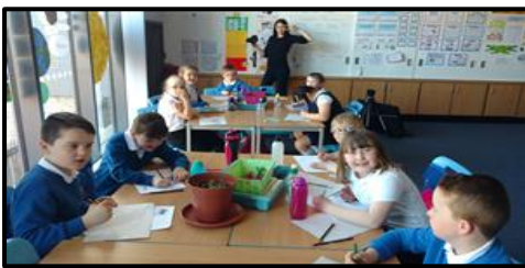
Children at Elderbank Primary.

Again we have had a very successful term of supporting teaching and learning of French and Spanish in our primary schools. Across North Ayrshire there has been much singing, playing and having fun while learning French and Spanish; for both children and teachers. Evaluations and feedback of their input has been overwhelmingly positive. The team have been working hard to continually add useful links and resources to the 1+2 Primary Language Learning staff site on Glow. We have also begun revamping the site to ensure it stays user friendly. The site is planned to be fully updated before the end of June.